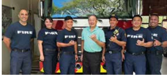
Station 2: Subbase (Pearl Harbor)