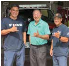
Station 3: Tripler AMC