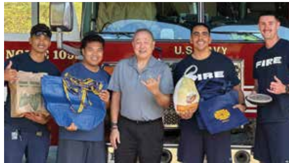
Station 9: Westloch