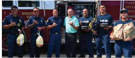
Station 8: Marine Corp Base Hawaii