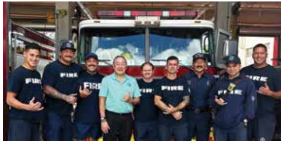
Station 1: Pearl Harbor (The Big House)

This effort was more than food—it was a message of solidarity and respect. Federal firefighters work tirelessly under difficult circumstances, and this visit reminded them that their sacrifice does not go unnoticed. As a credit union rooted in the fire service community, we proudly stand shoulder-to-shoulder with our federal firefighters. Mahalo for your service, resilience, and unwavering dedication!