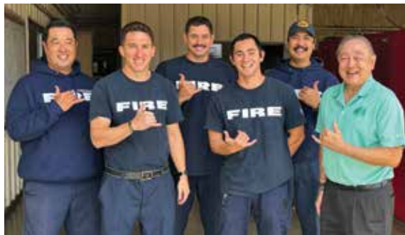
Station 6: Hickam (Da Raptor House)