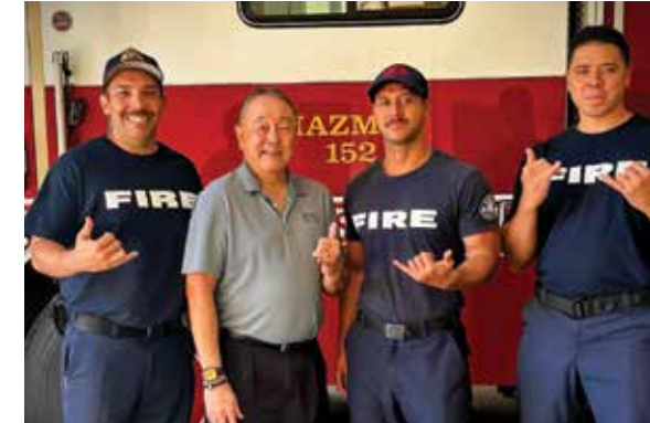
Station 15: Schofield Barracks