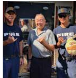
Station 5: Manana