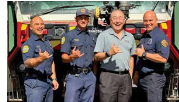
Station 14: Wheeler Army Airfield