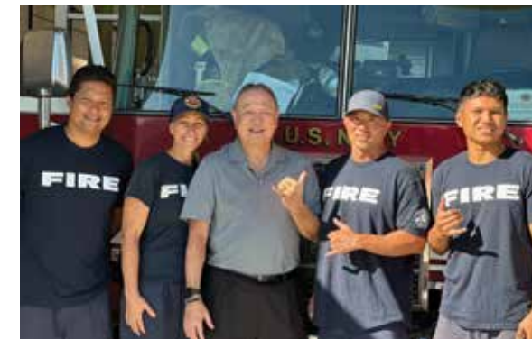
Station 16: Camp Smith