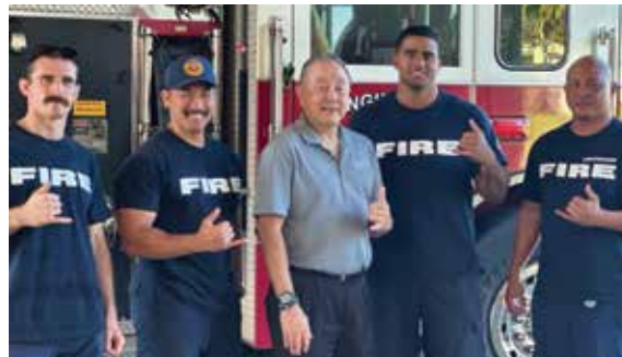
Station 10: Helemano Military Reservation