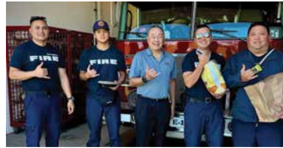
Station 7: NCTAMS (Whitmore)